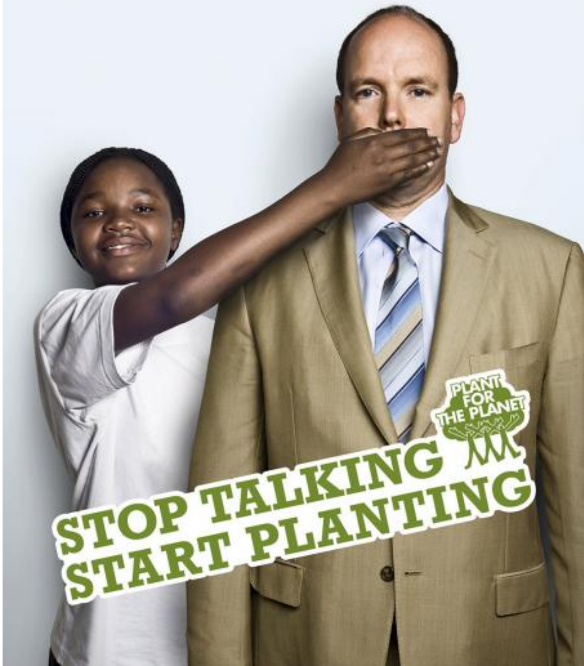
Prince Albert of Monaco supports the children.

S.D. Fürst Albert II von Monaco unterstützt die 12-jährige Malien. Sie und ihre Freunde werden in jedem Land der Erde 1 Millionen Bäume pflanzen. Helfen auch Sie mit im Kampf für Klimagerechtigkeit auf: www.plant-for-the-planet.org